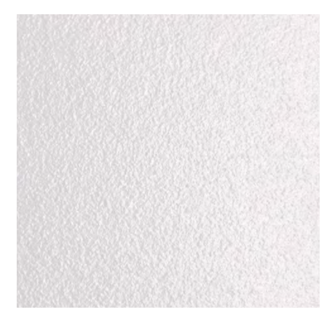
POWDER COATED STEEL

EVERY GLASS PIECE IS METICULOUSLY HANDMADE, UTILIZING TIME-HONORED METHODS, WITH MINOR DISTINCTIONS TO BE ANTICIPATED, ADDING TO THE UNIQUENESS OF EACH PIECE, ENSURING IT IS TRULY ONE OF A KIND