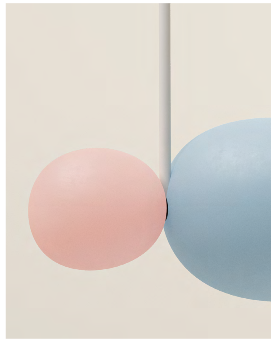
BARBICAN EDITION OF 20