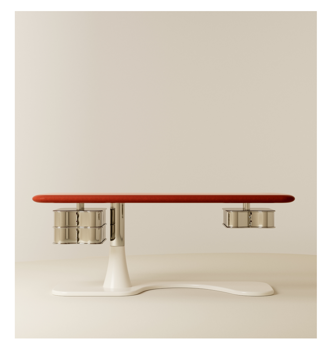
BLADE EDITION OF 10.