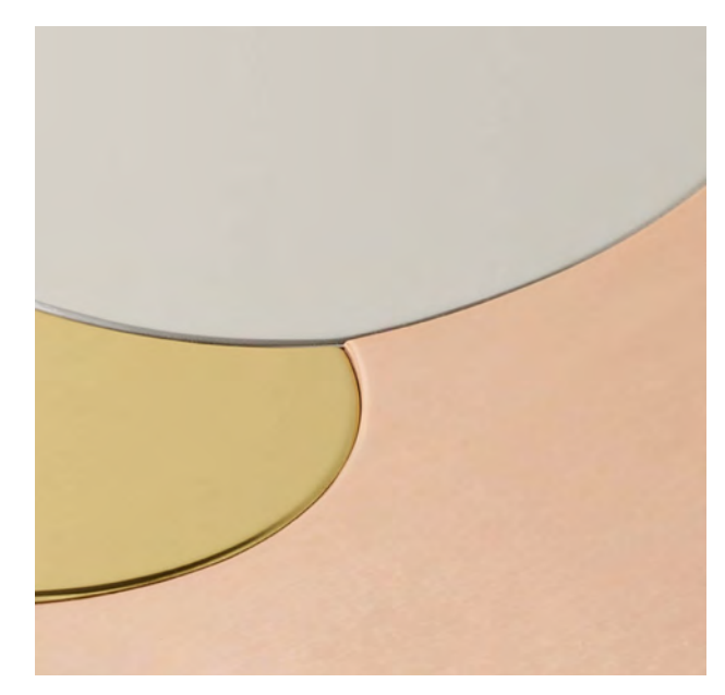
POLISHED ANODISED ALUMINIUM

WALNUT, A SOLID WOOD MATERIAL, NATURALLY REACTS TO FLUCTUATIONS IN TEMPERATURE AND HUMIDITY, CAUSING IT TO EXPAND AND CONTRACT. AS A RESULT, IT IS NORMAL TO ENCOUNTER VARIATIONS IN GRAIN PATTERNS, COLORS, AND TEXTURES, AS THESE CHARACTERISTICS ARE INTRINSIC TO THE WOOD