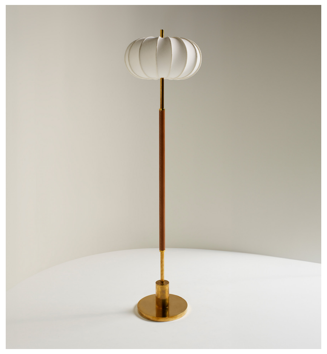
W 50 D 50 H 184 CM W 19.7 D 19.7 H 72.4 IN