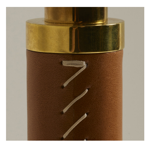
HAND WRAPPED LEATHER

THE DISTINCTIVE CHARM OF THIS NATURAL MATERIAL LIES IN ITS VARIATIONS IN TEXTURE, COLOR, VEINING, SHADING, AND OVERALL APPEARANCE. THESE INHERENT DIFFERENCES CONTRIBUTE TO ITS INDIVIDUALITY AND ADD TO THE UNIQUE CHARACTER OF THE PRODUCT