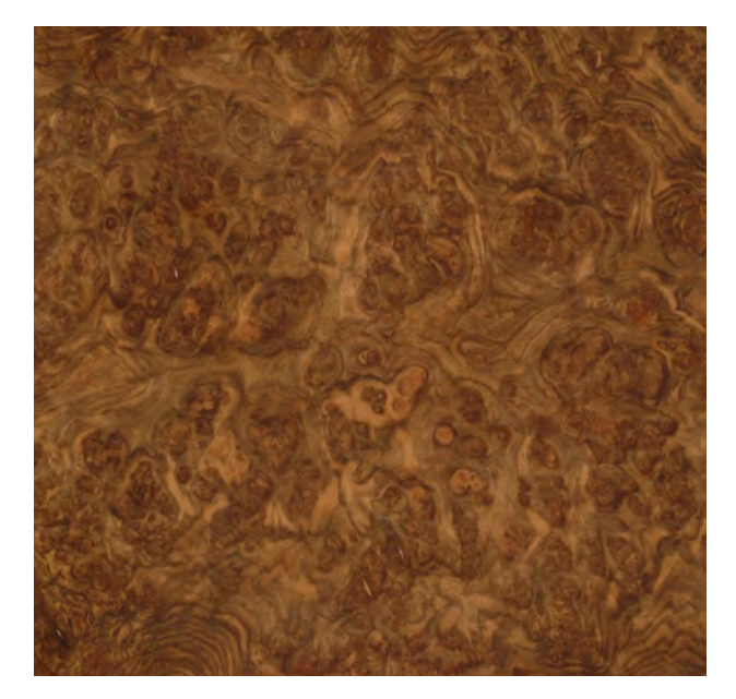
EUROPEAN WALNUT BURR

WALNUT, A SOLID WOOD MATERIAL, NATURALLY REACTS TO FLUCTUATIONS IN TEMPERATURE AND HUMIDITY, CAUSING IT TO EXPAND AND CONTRACT. AS A RESULT, IT IS NORMAL TO ENCOUNTER VARIATIONS IN GRAIN PATTERNS, COLORS, AND TEXTURES, AS THESE CHARACTERISTICS ARE INTRINSIC TO THE WOOD.