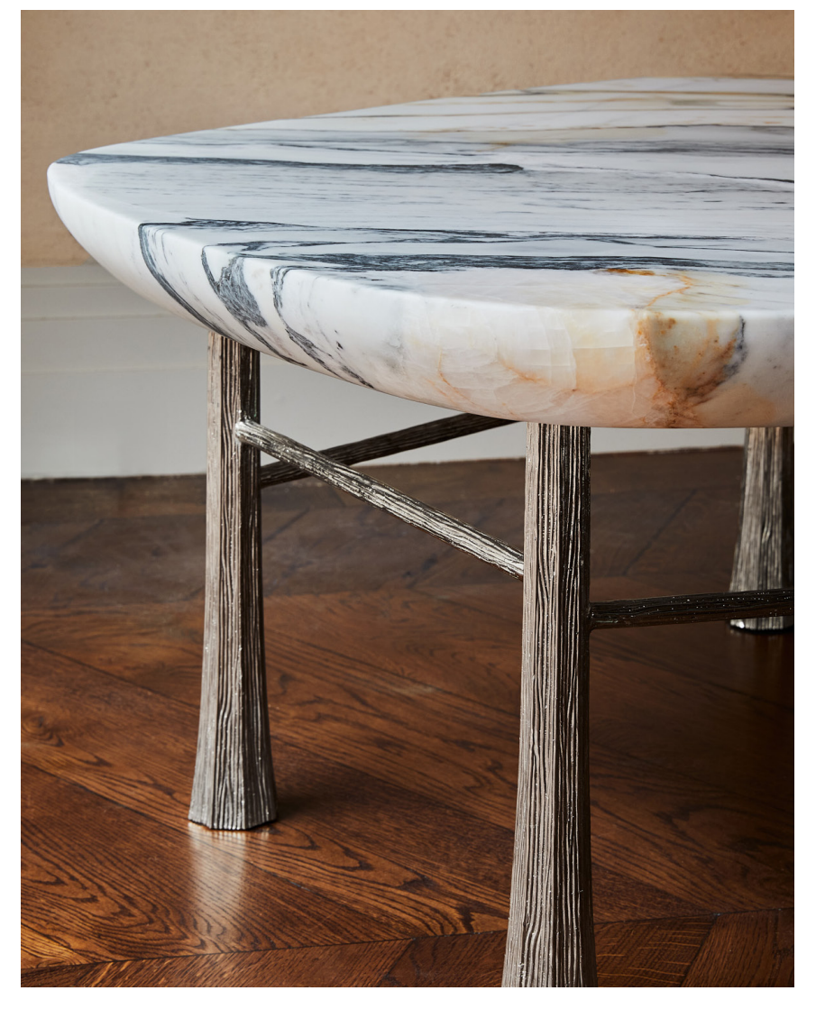
POND EDITION OF 10