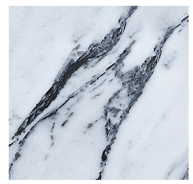
MARBLE THE DISTINCTIVE CHARM OF THIS NATURAL MATERIAL LIES IN ITS VARIATIONS IN TEXTURE, COLOR, VEINING, SHADING, AND OVERALL APPEARANCE. THESE INHERENT DIFFERENCES CONTRIBUTE TO ITS INDIVIDUALITY AND ADD TO THE UNIQUE CHARACTER OF THE PRODUCT