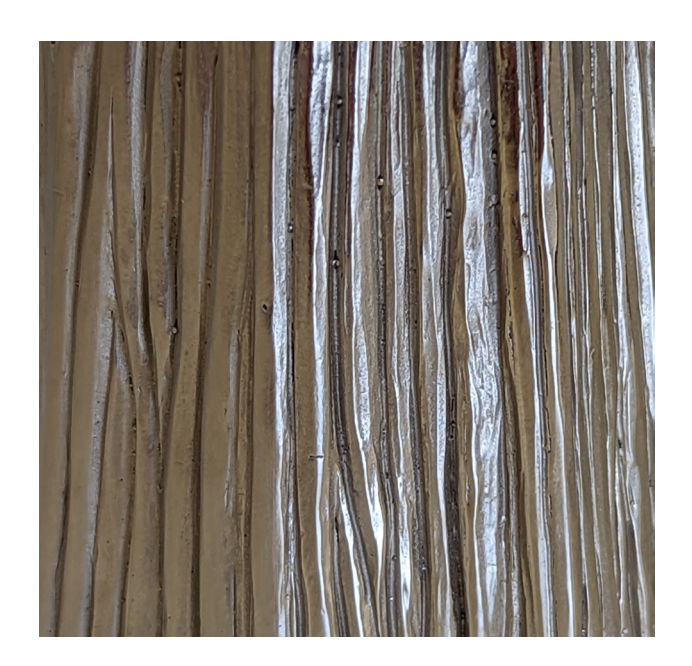
NICKLE PLATED CAST BRONZE