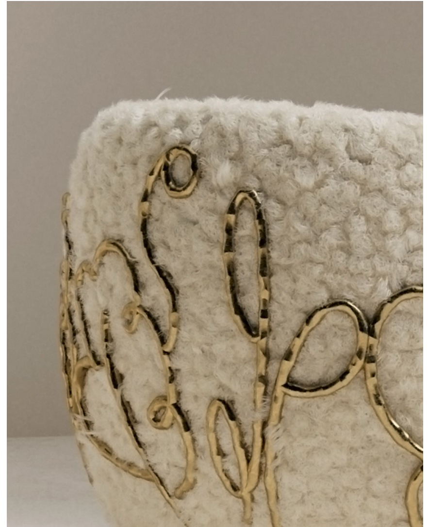
SPRING EDITION OF 28