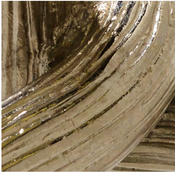
NICKEL PLATED CAST BRONZE