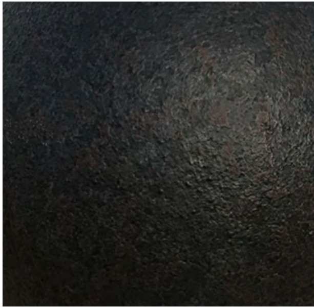
HAND FORGED STEEL